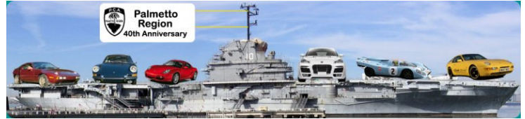
Palmetto's 40th anniversary on the USS Yorktown

JUNE 20-21 - Please Join Palmetto Region in Celebrating their 40th Anniversary!! Palmetto Region will be celebrating their 40th Anniversary with a special event at Patriots Point just outside of Charleston, SC. The weekend kicks off with a Gimmick Rally, returning to Patriots Point for a Race Car display from local professional race team Automotrics. Then, there will be cocktails and dinner aboard the USS Yorktown Aircraft carrier to hear stories from the guest speaker Vic Elford . Optional events on Sunday will round out a fun filled weekend. Put this on your calendar. Details at www.pcpalmetto.org